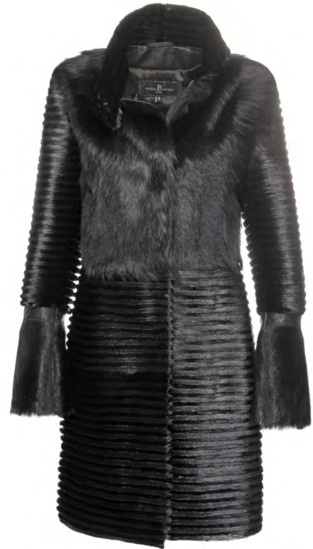
look 04. Goat and seal fur coat - Ref : 1453