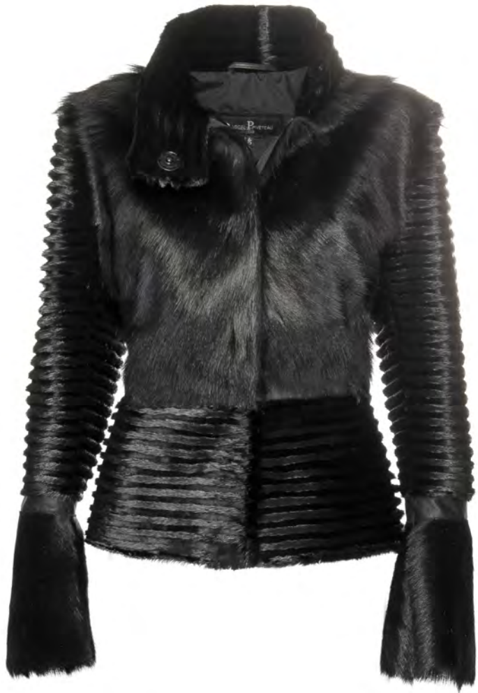
look 03. Goat and seal fur jacket - Ref : 1452